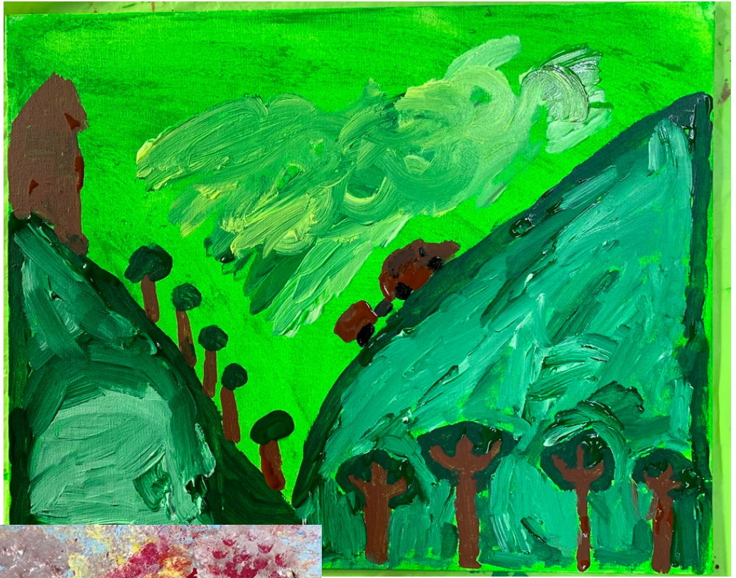
George Landscape with car