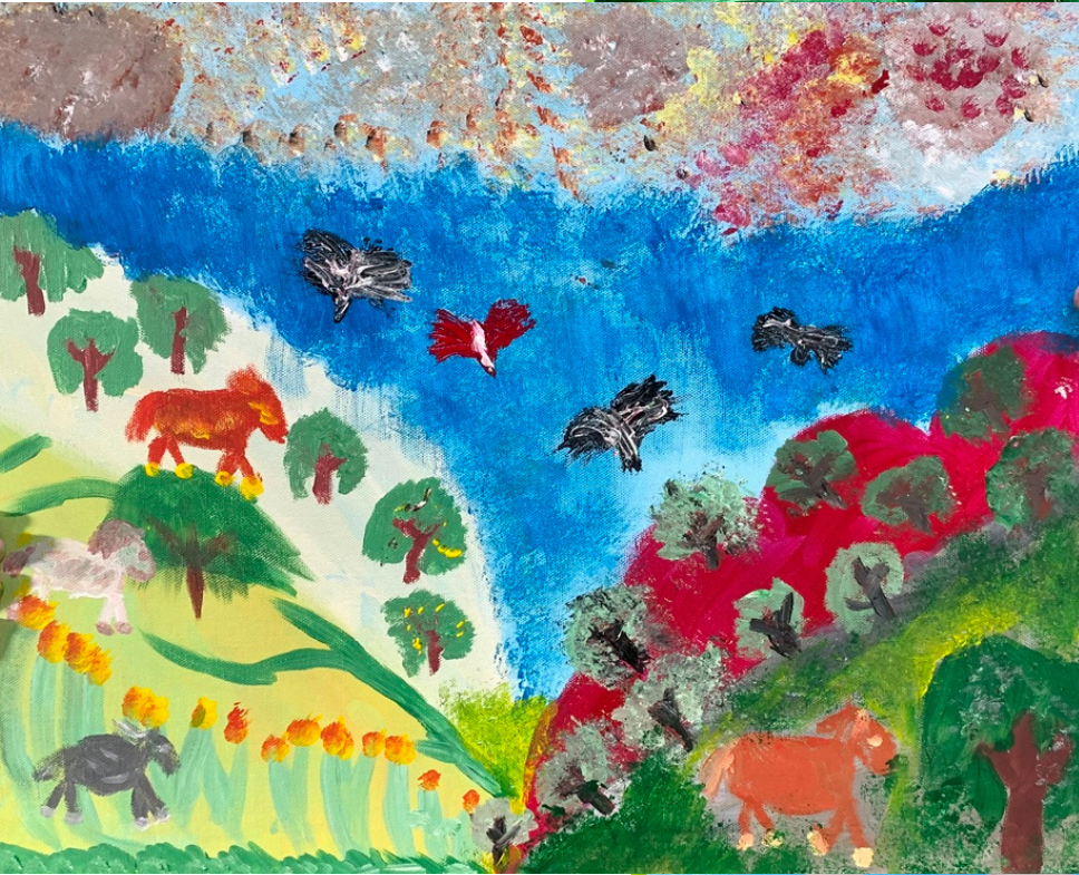
Maree Landscape with horses held