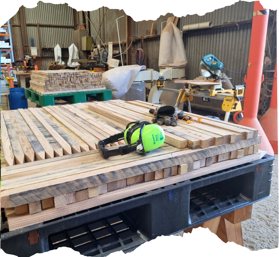
Woodies have been busy with Picnic tables for PCYC, car washing and of course keeping up their stock of pegs and stakes, great team work guys