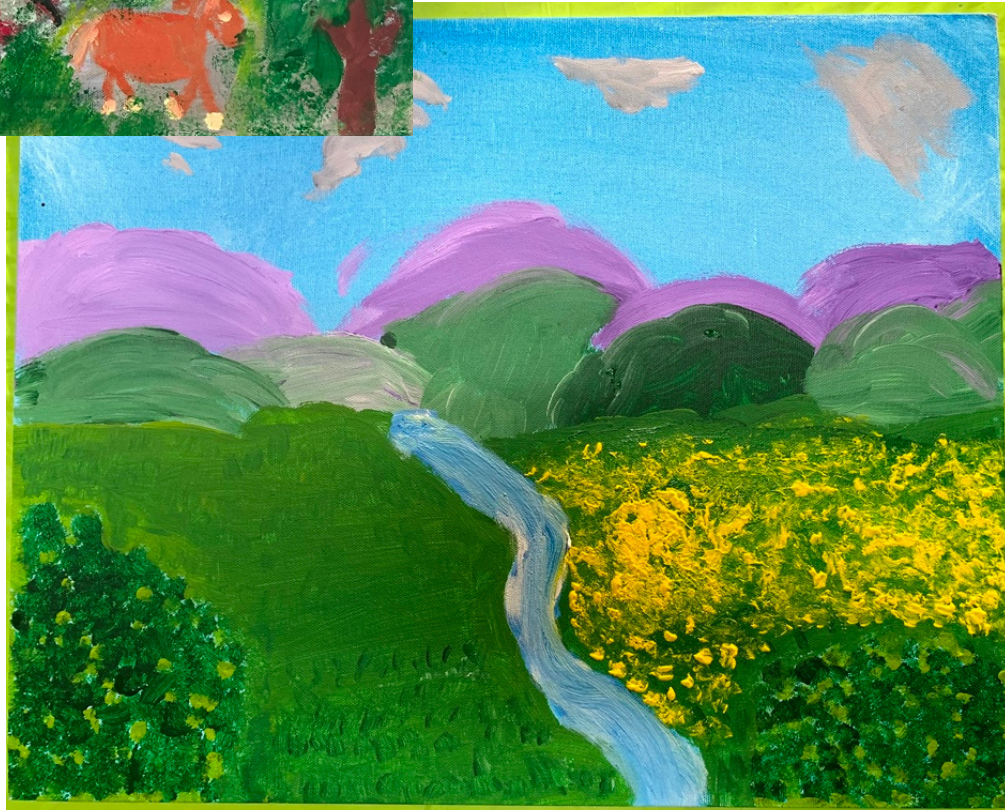
Lenore Landscape with canola field